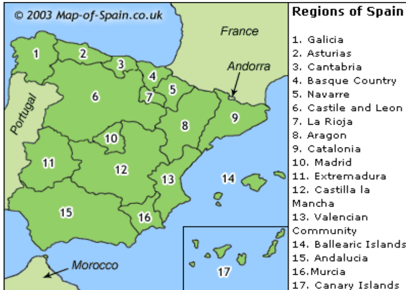
Figure 1: Regions of Spain

Note: Kindly and freely available from http://www.map-of-spain.co.uk/