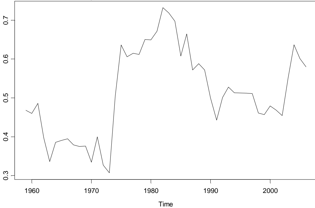
Figure 3 The temporal evolution of the degree of information content in the maximum eigenvalue of the empirical correlation matrix formed from the time series of annual real GDP growth for the main world economies of the US, UK,, Germany, France, Italy and Japan, 12 year windows, 1948-2006

Over the 1948-1959 period, for example, the first observation in the chart, the ‘market’ eigenvalue took up just under 50 per cent of the total of the eigenvalues, indicating a reasonable but not dramatic degree of convergence of their business cycles. But then, advancing year by year there is a distinct trend fall, until over the 1962-1973 period, a minimum is reached where the maximum eigenvalue is only 30 per cent of the total.