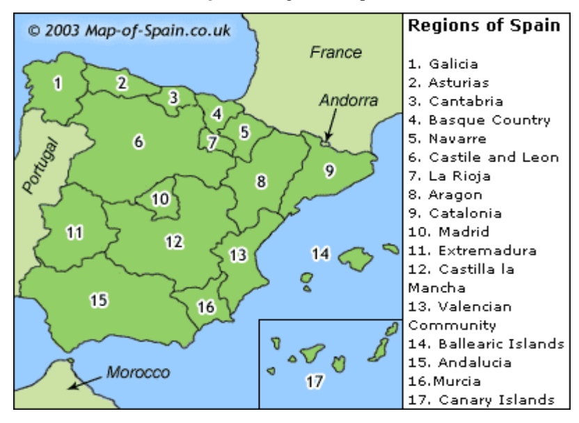
Figure 1: Regions of Spain

Note: Kindly and freely available from http://www.map-of-spain.co.uk/