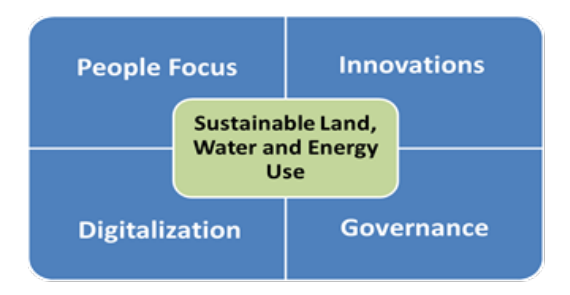
Figure 2: Key Policy Action Areas